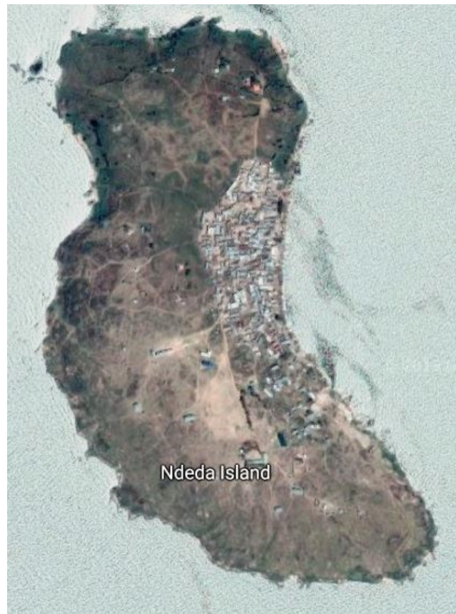
Figure 1: Map of Ndeda Island.

Most of the active components in a mini-grid are equipped with power electronics, though which they are connected to the grid system. Power electronics are developing all the time and becoming cheaper, smaller, better (higher voltage, current, power, efficiency and shifting frequency) and more reliable (self-protection). The challenge remains, however, that the power transistors have a maximum operational voltage and current. If the maximum voltage is exceeded, the transistor may be immediately damaged. The maximum current is dependent on the maximum allowable temperature of the semiconductor and, as its inherent thermal capacity is very low, just a short overcurrent may damage the transistor. The lifetime and reliability of power electronics are therefore critically dependent on the design of the built-in self-protection.