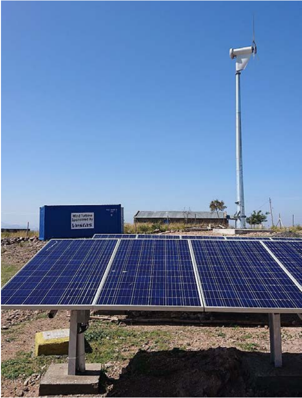
Figure 2: The solar panels and the wind turbine at Ndeda Island.